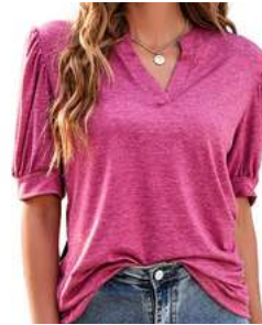
PUFF SLEEVE TEE

A cute tee you can dress up or down, and layer in cold weather.