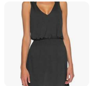
SWIM COVER UP

Great to throw on over a swimsuit on the way to the pool.