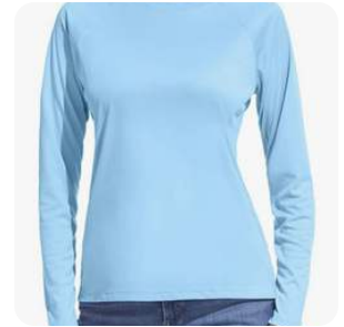
LONG SLEEVE TEE

A thin long sleeve tee is perfect for layering.